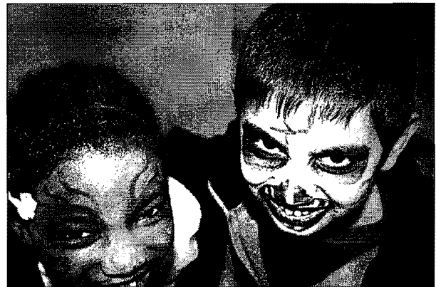
The Annual Halloween Party featured face painting, miniature pumpkin painting & refreshments