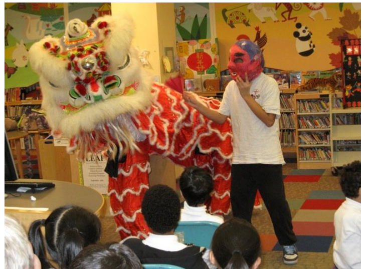
February's Chinese New Year Celebration presented Independence Library Friends