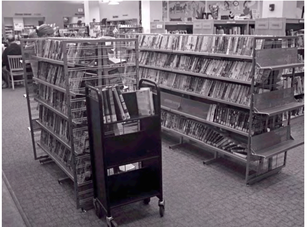
New Paperback Book Racks

Finally, during the same period, the Friends Present program, with the help of the Philadelphia Activities Fund Grant, paid for a Kwanza event, a Chinese Cultural program, a Conversations on Jazz program for teens and adults, and a Native American Cultural program for teens and adults.