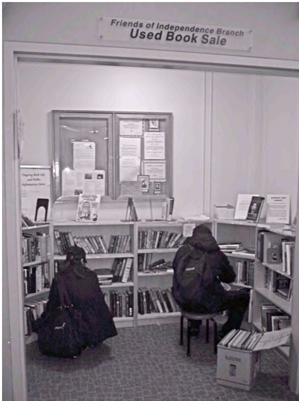
The Friends Nook at the Independence Branch