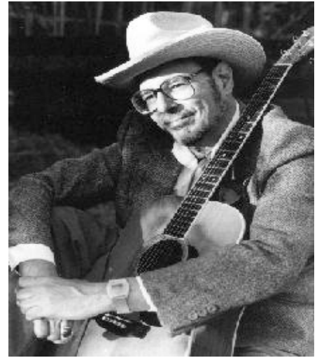
Folk music icon Saul Broudy will perform at the Independence Branch Library on November 10

The Friends of the Independence Branch encourage all ages to come learn and sing the songs soldiers sung from the Civil War to the Vietnam War with Saul. Independence Branch will host To Honor Our Soldiers on Tuesday November 10 at 4:30 pm.